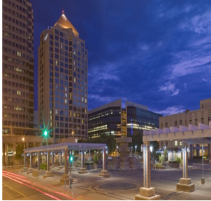
Hyatt Regency Albuquerque, New Mexico

The annual conference for the Southwest Association of Student Assistance Programs will be November 7-10, 2010 in beautiful Albuquerque, New